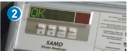
THE OK MESSAGE MEANS THE SHOE HAS BEEN INSPECTED WITH NO DETECTION OF A METAL THREAT