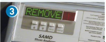
THE REMOVE MESSAGE INFORMS THE PASSENGER OF THE COMPLETION OF THE ANALYSIS