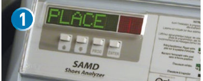
SAMD CONTROL UNIT SHOWS THE PLACE FOOT MESSAGE