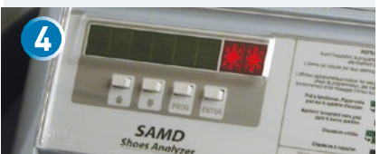
IN CASE OF DETECTION, SAMD GENERATES AN ACOUSTICAL AND A VISUAL RED ALARM