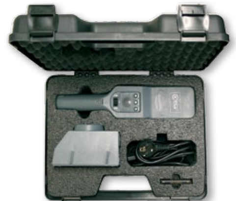
V140 CARRYING CASE

THE SPECIAL ERGONOMIC SHAPE OF THE DEVICE ALLOWS INSPECTION WITHOUT THE INTERFERENCE OF THE OPERATOR'S FINGERS